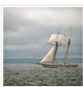
Sailing into Pictou