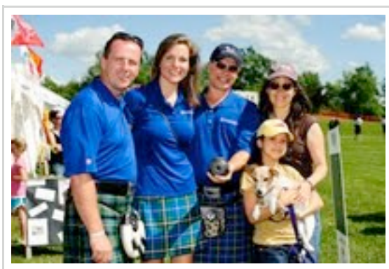
(Click image to visit photo gallery.)

It's not every day you come across a Neolithic Pictish orb , or at least a replica of a Neolithic Pictish orb. And yet in New Glasgow we were introduced to a man whose fascination with orbs of an undetermined purpose, set in train a fabulous chain of events.