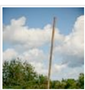
Fun things to do in a kilt: #1 Highland Games